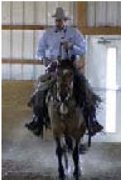
Horseman's Obstacle Challenge

The PNHA is dedicated to providing a means of education for horse enthusiasts of all ages, skill levels and disciplines. Over the years we have organized and presented various opportunities for learning horsemanship skills. Our goal is to continue to do so in the years to come.